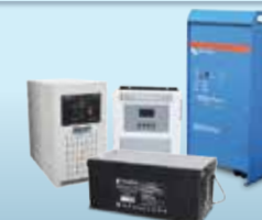
INVERTER POWER BACK UPS