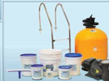
POOL EQUIPMENT & CARE

Only Davis & Shirliff can offer the Choice, the Value, the Availability and the Support to provide a Complete Solution for all Domestic Water and Energy needs.